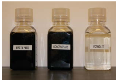
Figure 1: Samples from EcoRegen™ System: waste brine feed (L), concentrate sent to waste (C), and filtered brine (R)

The filtered brine can then be reused in the regeneration process while the concentrate is sent to waste (Figure 2), resulting in a significantly smaller waste volume. The volume of brine that can be recycled ranges from 140 to 280 gal/MG of plant