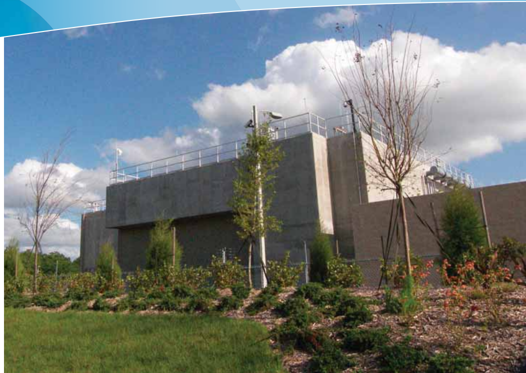
Figure 1: St. Cloud, FL 9 MGD MIEX® Treatment System

First quarter distribution samples were taken only four days after MIEX® System