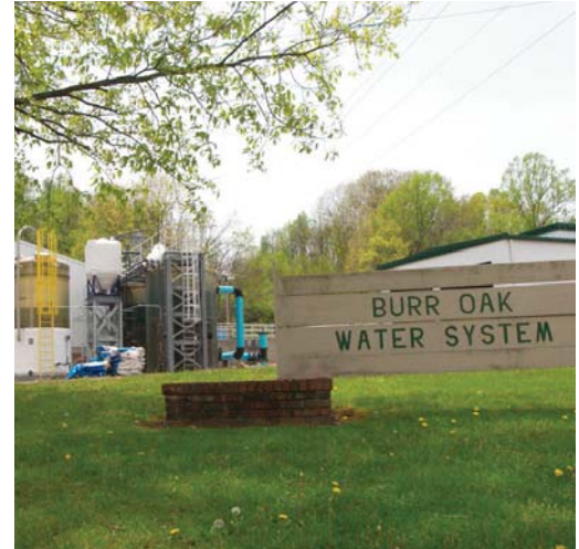
Figure 1: MIEX® System at Burr Oak Regional Water District in Glouster, Ohio

“Our main objective was to provide potable water to our customers that meets the safe drinking water laws of Ohio and meet EPA’s timeframe. The quick implementation of the MIEX system allowed us to do just that.”