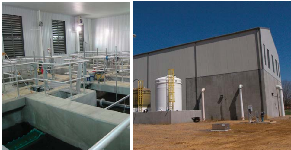
Figure 1: Inside view (left) & outside view (right) of MIEX® System at Arab, Alabama

“We looked all over the United States to find a system that would do the job and that we could afford. The MIEX® System beyond a doubt performed better than all other alternatives.”